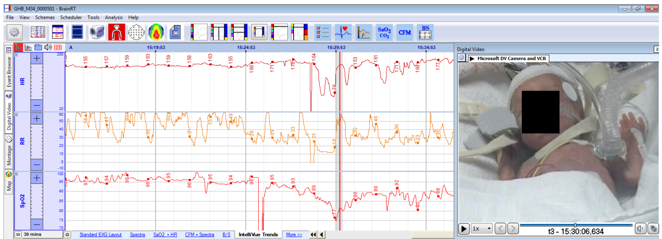
BrainRT example: monitoring of neonatal intensive care patient

As many patients are monitored for days, weeks or even months, it is important to get a good interpretation of all these data. With the BrainRT software, it is possible to do that. You can record signals from the patient monitor and use the extensive review options of the software for further interpretation.