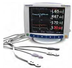
Near Infrared Spectroscopy (NIRS) to measure cerebral oxygen saturation

To distinguish artefacts from real problems you can record video signals of the patient. The video recordings are automatically synchronized with the signals and can be reviewed even during the acquisition. Different models of cameras are available.